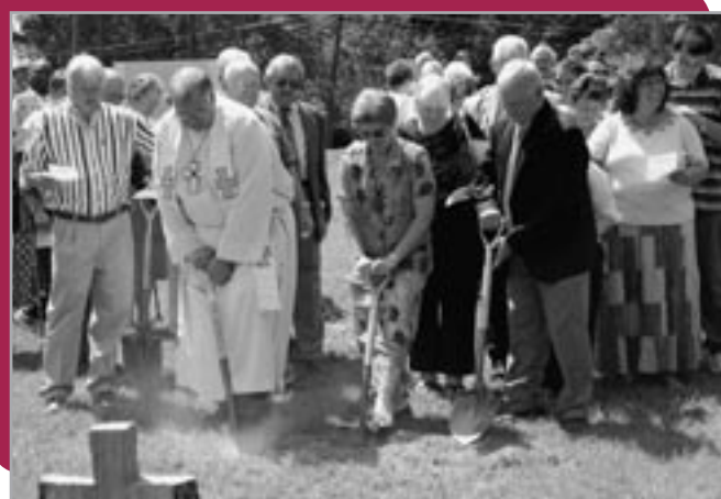
Holy Trinity Lutheran Church, located at 3000 Garden Lakes Blvd., recently broke ground on a new sanctuary building on its campus. The new sanctuary building will allow a larger venue for the church's services. When the new sanctuary is complete, Holy Trinity will remodel its current building into better Sunday School facilities.