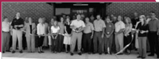
VAST Industrial Supply, LLC recently held a ribbon cutting ceremony to mark the opening of its new facility at 1581 Technology Parkway. VAST supplies the Northwest Georgia area with a wide variety of industrial products and needed services. VAST operates an extensive warehouse and a fleet of delivery vehicles providing daily product to large mills, mid-sized manufacturing plants, small shops, and other facilities.