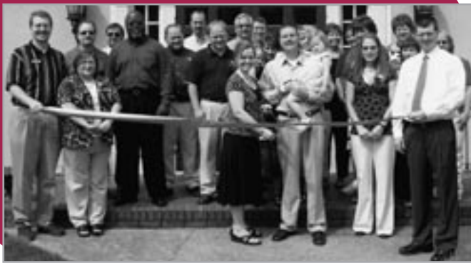
Home Inventory Professionals celebrated the opening of its business with a ribbon cutting held at the Chamber. Home Inventory Professionals educates homeowners on the importance of proper documentation of belongings and offers an extensive array of confidential and professional inventory services tailored to meet the needs of the individual homeowner.