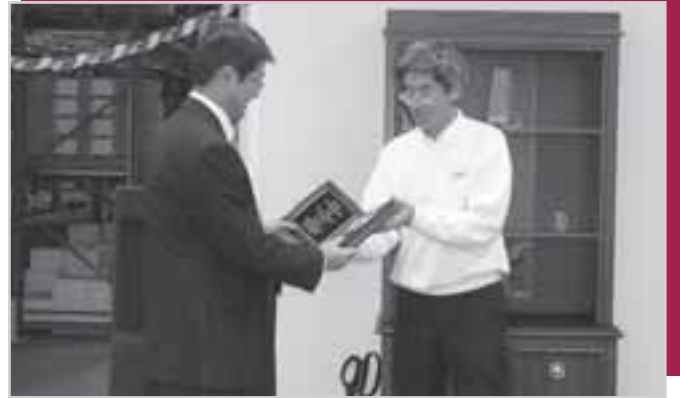
NIFAST, a supplier to SUZUKI MANUFACTURING OF AMERICA CORPORATION, has moved portions of their operations to Rome, with their home base being in Chicago. The ribbon cutting introduced many individuals in the community to the new business.