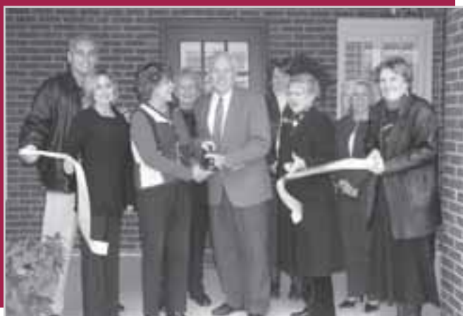
Chamber members and Ambassadors were present at a ribbon cutting for NORTH GEORGIA MEDIATION FIRM, located on West 8th Avenue in Rome.