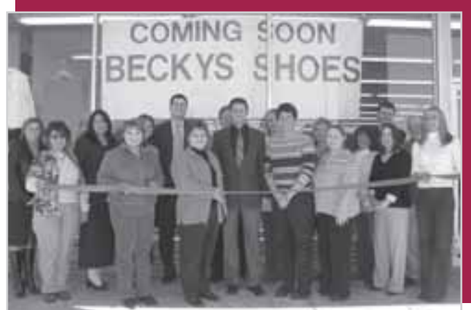
BECKY'S SHOES, located in Gala Shopping Center in West Rome, is featured at their recent ribbon cutting, marking their opening in Rome.