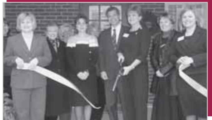
HOME INSTEAD, a senior care program, pictured at their recent ribbon cutting with local Chamber members and Ambassadors.