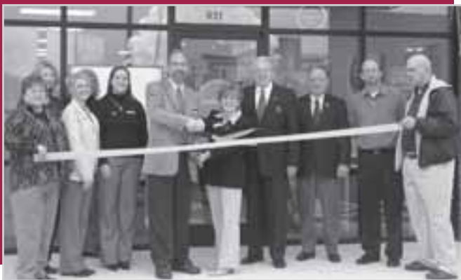
H & R BLOCK, located on Hwy. 411, recently held a ribbon cutting to celebrate the opening of their new location.